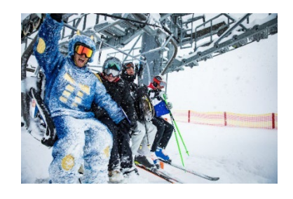
Friday, 17th March, Evening Networking dinner in the capital of the Alps