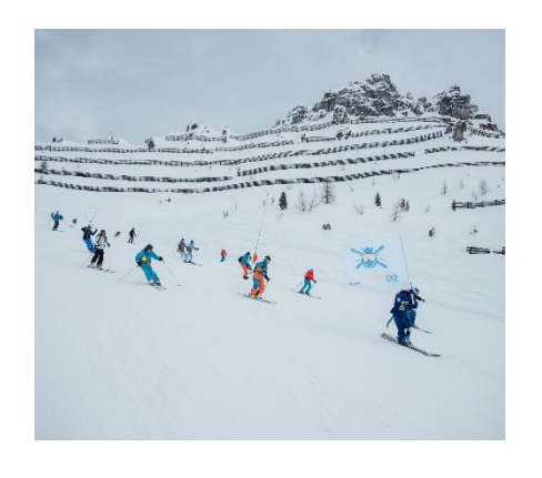
SKIING IN THE ALPS

Top-class speakers from all over Europe hold exciting workshops and talks in and around the ski huts.