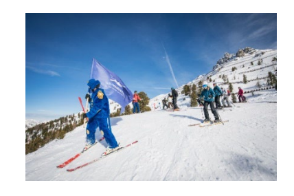
Saturday, 18th March, Evening Pitch final and award ceremony, dinner with after party and live-band