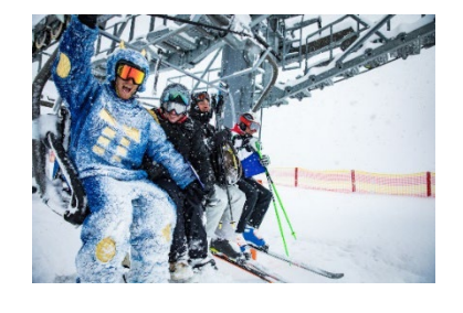
Thursday, 16th March, Evening Opening Evening with Keynote, Networking Pitch and Dinner