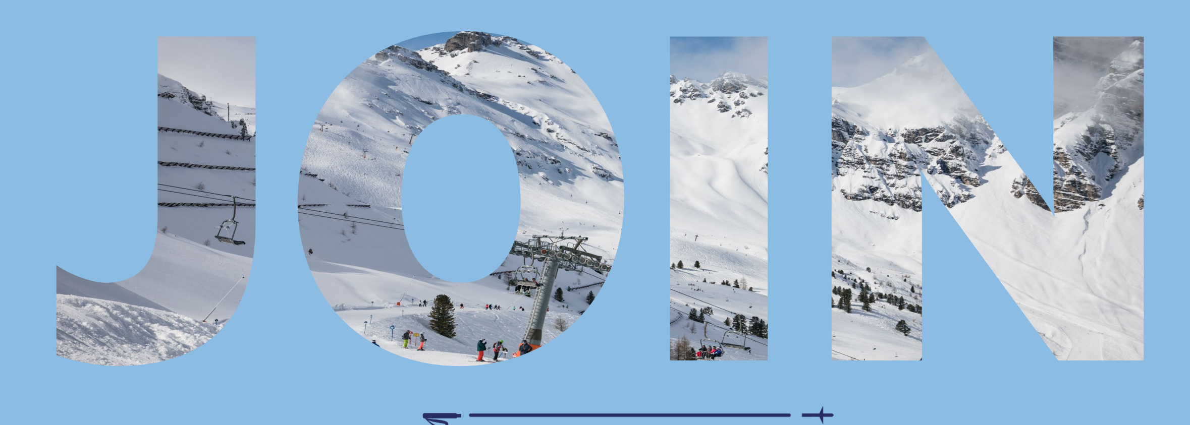
AND BECOME A SKINNOVATOR